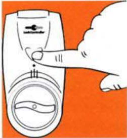
Smart Shut-off Valve